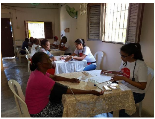
Dominican Republic MMM activities