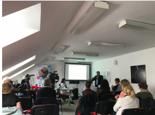
Press Conference in Bratislava

*Implement changes in the health insurance companies' approach to the lifestyles of their insured persons, to allow for reimbursement of health care expenses that promote lifestyle improvement.