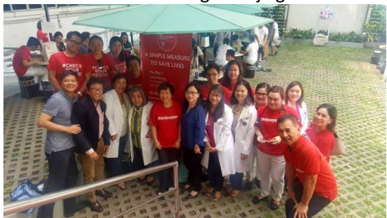
Philippines MMM18 Hypertension Screening

Early indications suggest the number of countries taking part in MMM18 will exceed the eighty that contributed to the campaign in 2017. BP screening has taken place across many regions, cultures and in diverse screening locations, for example hospitals, community centres, schools, supermarkets, pharmacies, markets, temples and factories. The collection and analysis of MMM18 data is now underway, with the hope of releasing the results in September during the ISH Biennial Scientific meeting in Beijing.