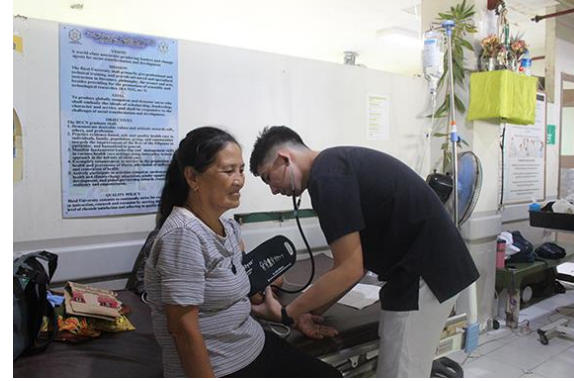
Blood Pressure screenings at BRTTH

In celebration of Hypertension Awareness Month and in commemoration of the centennial year of the Bicol Regional Training and Teaching Hospital, a simultaneous Hospital-Wide Blood Pressure Screening was conducted on May 17, 2018. An extension of the advocacy of our Hypertension Clinic, the activity aimed to screen for blood pressure in at least 100 participants for one hour in the morning and afternoon. Ten hypertension kiosks were set up in hospital departments, staffed by medical interns/ clerks and supervised by department residents-incharge. A total of 359 personnel, ambulatory patients and visitors were screened for hypertension. Seventy-six (21%) were noted to have BP≥ 140/90, hence advised to have BP monitoring and workup upon follow-up at the OPD Hypertension Clinic.