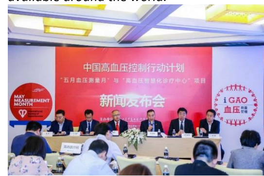
MMM holds Press Conference in China.

Professor Neil Poulter, President of the International Society of Hypertension (ISH), states: "We know we can often reduce blood pressure (BP) with lifestyle changes and existing drugs, but unless people know they have hypertension they can't be treated. Our key objective is therefore, not only to increase public awareness, but also to collect the evidence needed to help influence global health policy and make BP screening more widely available around the world."