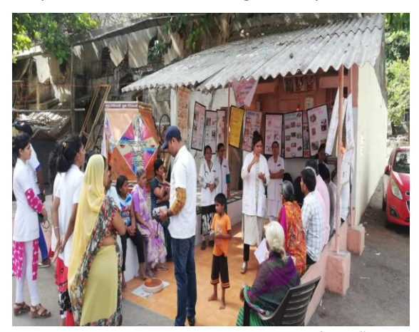
The urban community was the setting of our "Know Your Blood Pressure" campaign.

Many people are not aware about their blood pressure, even though they know it is a silent killer. Moreover, they show their ownership of this disease, saying, "My blood pressure is 180/110 mm/Hg, but I don't take any medicine for it." To combact this attitude, we initiated various community outreach programmes prior to and leading up to World Hypertension Day with the aim to spread awareness about high blood pressure.