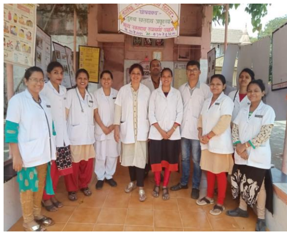
The Health Team provided awareness of hypertension related to stroke and CV disease, and the importance of physical activity and nutrition in preventing and controlling hypertension.

Finally to quote "Success is not final; failure is not fatal. It is the courage to continue that counts." Thus, we will continue our work until all people in India know their count.