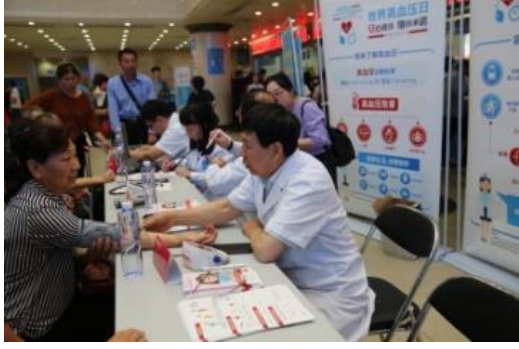
The 2nd Hospital, Hebei Medical University

According to reports from Chinese Hypertension League members, 874 medical professionals participated in the World Hypertension Day Campaign, and 11,976 residents in China enjoyed free blood pressure measurements and medical consultations on 17<sup>th</sup> May 2019.