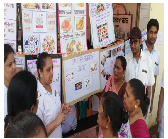
Hypertension awareness was provided by group teaching, using posters stating causes, risk factors, clinical manifestations, treatment & complications.

started bringing in their family members to have their blood pressure checked, and by 2 pm we had checked 300 blood pressures.